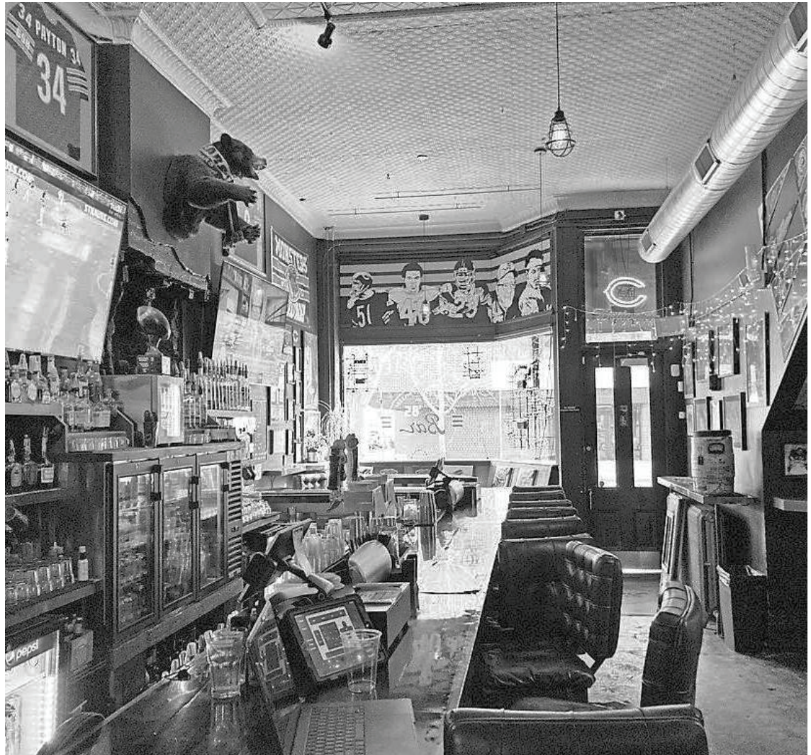
The Chicago Bears-themed 85 Bar awaits bargoers before opening time on Feb. 14 in East Village in Des Moines. The bar is expanding, adding a second location, 85 Bar West, in Waukee. Owners hope 85 Bar West will open by the end of May.

The bar will be at the east end of a small shopping center built in 2022 that also includes Waukee Dental and Tropical Smoothie Cafe, according to Dallas