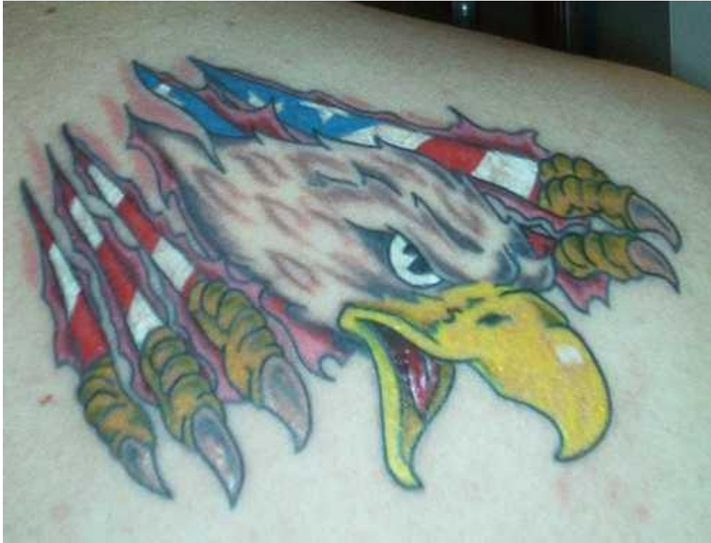
Figure-1: Example of an Americana Tattoo