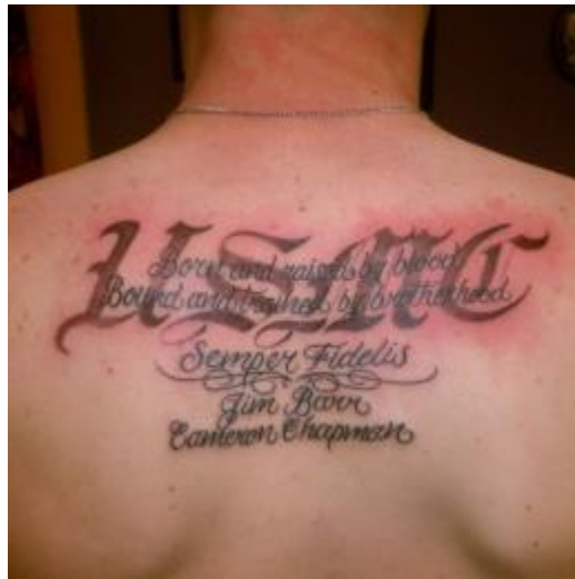
Figure-6: Example of an Faith and Ideology Tattoo Source: http://www.grunt.com/corps/tattoos/details/8849/ .