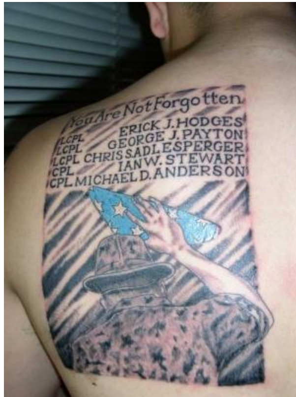
Figure-7: Example of a Memorial Tattoo