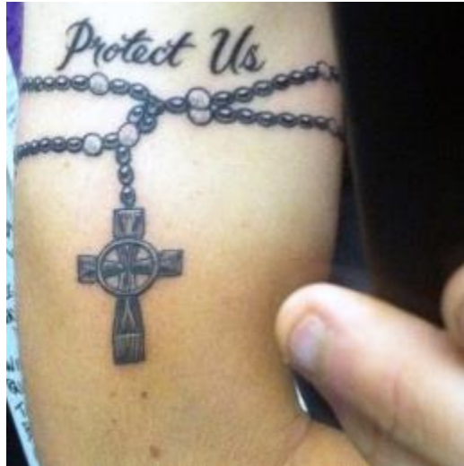
Figure-5: Example of a Faith and Ideology Tattoo