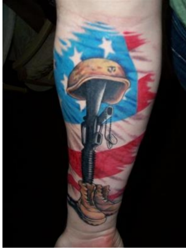
Figure-8: Example of a Memorial Tattoo