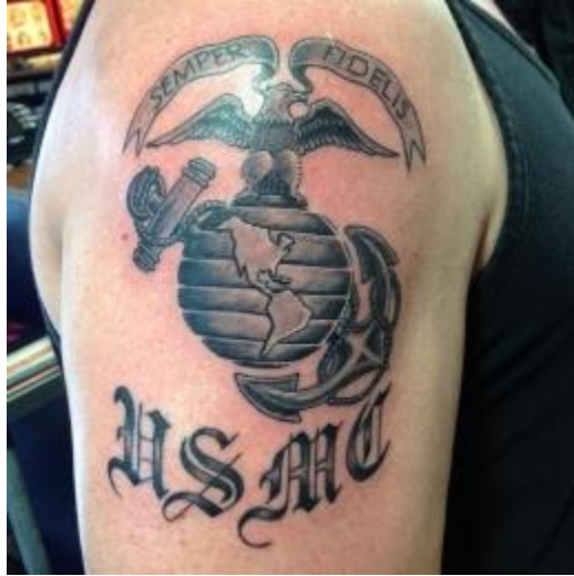
Figure-3: Example of a Pride in Service Tattoo